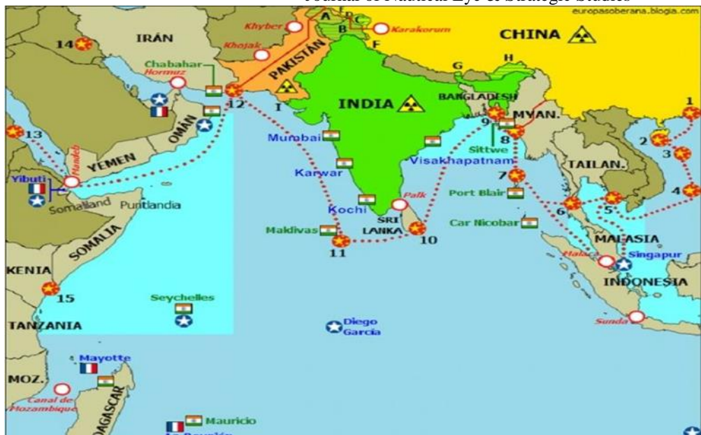
Figure 3: Pearl of String in IOR

China has planned economic and military development for the next 50 years, divided into three phases. The first Phase from 2000-2010 concentrated on economic activities, doubling GDP, and improving the capabilities of the Navy from Green Water to Blue Water. The second stage further doubled the GDP and development of 06 Aircraft Carrier groups from 2010-2020. As per the US Report of 2022 Chinese Naval units is expected to grow to 420 ships by 2025 and 460 ships by 2030.(O'Rourke, China Naval Modernization: Implications for U.S. Naval Capabilities, 2023) In the final stage of thirty years, spanning from 2020-2050 Chinese will be the largest economy and its navy powerful enough to project itself in all oceans, which is causing worries for US.