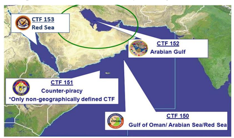
Figure 1: CTF's Area of Responsibility